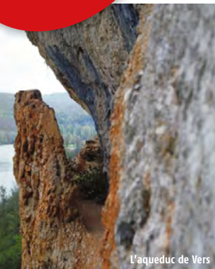
L'aqueduc de Vers

At the church, take the «Mas de Lucet» road and get on to the GR 46 (red and white waymarking) At the next crossing, take the road left which starts off on the flat and then descends into the Vers Valley semi-troglodytic barn in ruins). Go past the Raffy mill then cross the hamlet of «Benedicty». Further on, on a bend, leave the path which goes up into a coomb and turn left.